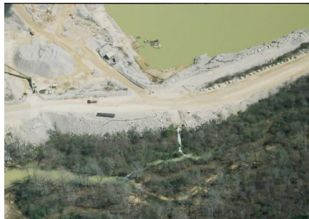
Discharges from Vulcan Construction Materials Bessemer Quarry (July 28, 2005) © Nelson Brooke (March 10, 2004)

Two months later, days before the suit could be filed, the Alabama Department of Environmental Management (ADEM) issued a proposed order containing a penalty of $50,000 without explaining the application of the 6 penalty factors required by Alabama law, and without setting out findings of fact which support the penalty amount.