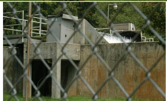
4,473 Alleged CWA Violations East Walker Co. Wastewater Treatment Plant