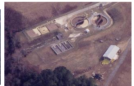
Donaldson Correctional Facility & W.W.T.P. © Nelson Brooke (March 10, 2004)