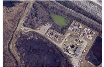
Sloss Industries Wastewater Treatment Plant © Nelson Brooke (May 2004)

Sloss Industries was repeatedly dumping illegal amounts of cyanide into Five Mile Creek, a tributary of the Black Warrior. Sloss had a permit to dump a little over one pound of cyanide a day. However, they exceeded the cyanide portion of their